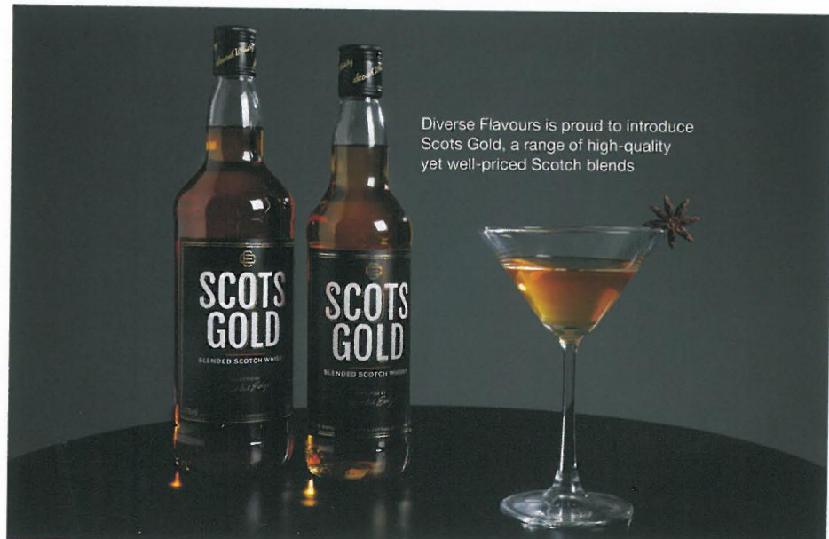
Diverse Flavours is proud to introduce Scots Gold, a range of high-quality yet well-priced Scotch blends